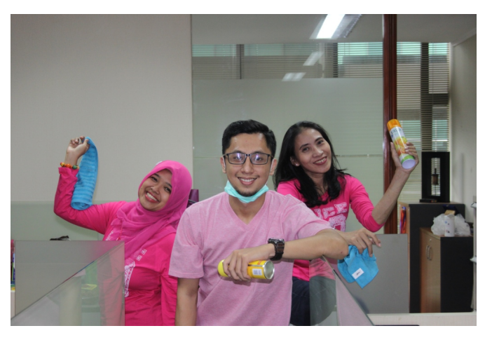
Human Capital Division