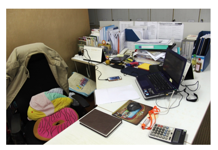
The Best Makeover (Before)