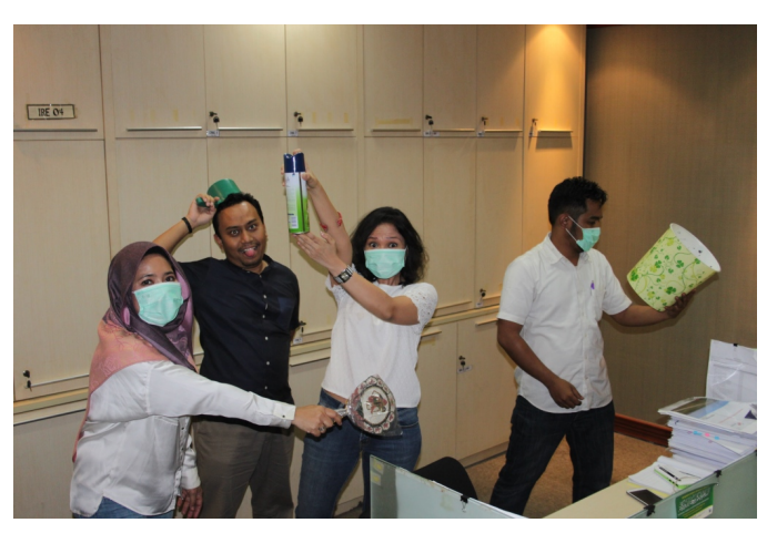
RMC & Internal Audit Division