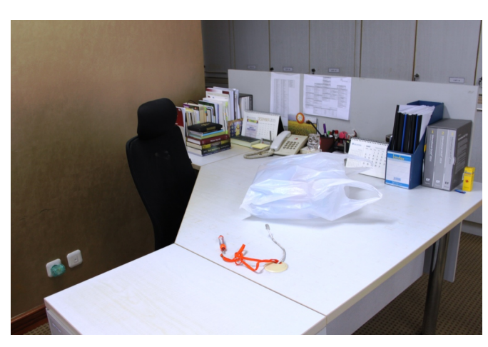
The Best Makeover (After)