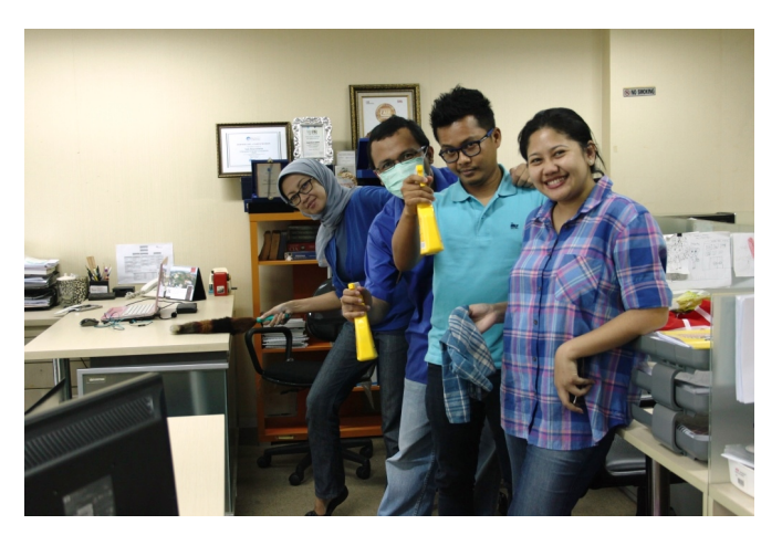
3rd Winner: Corporate Affairs Division