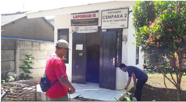
Photograph of floor before renovation