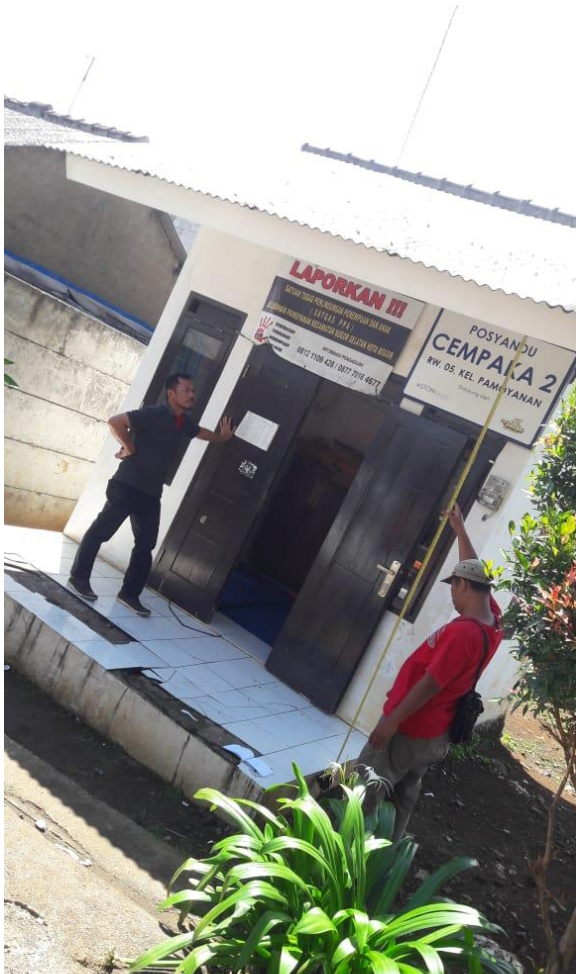
Photograph before renovation