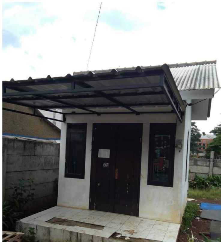
Photograph of roof after renovation